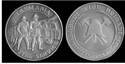
Plate 20. Obv. and Rev.

Metal: Silver. Size: 22 mm \Phi . Maker: Stokes & Son. Issued: 100.