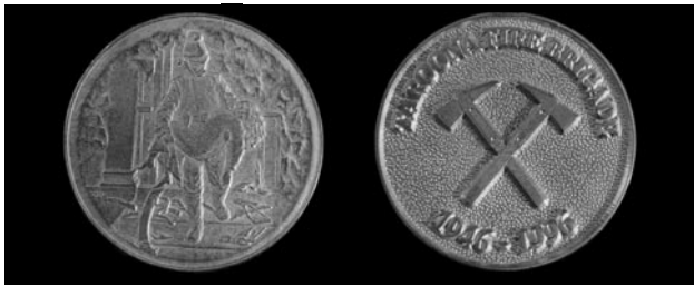
Plate 22. Obv. and Rev.

Metal: Silver (15), bronze (60). Size: 51 mm \Phi . Maker: Hafner Mint, Melbourne.