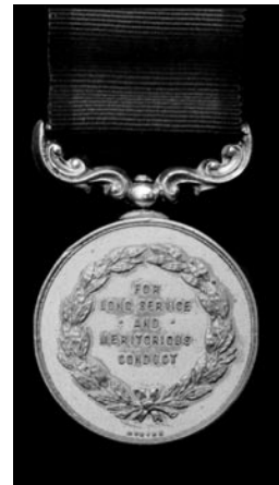
Plate 12. Rev.