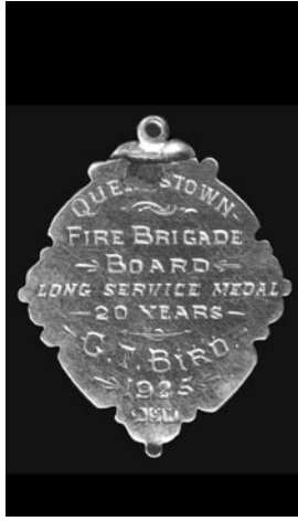
Plate 7. Rev.

Maker: Local jeweller; centre piece by Stokes & Son, Melbourne.