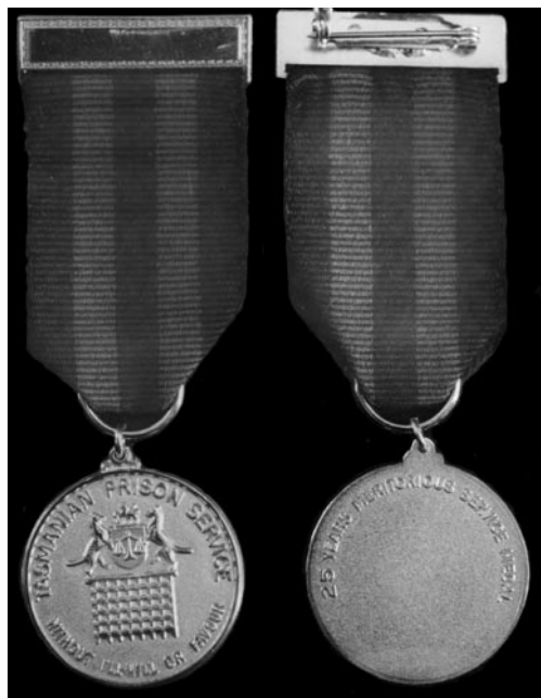
Plate 29. Obv. and Rev.

Tasmanian Prison Service 25 Years Long Service Medal.