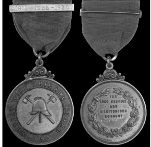
Plate 2. Obv. and Rev.