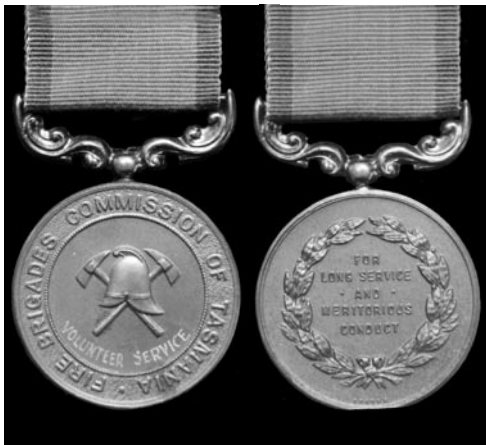
Plate 10. Obv. and Rev.