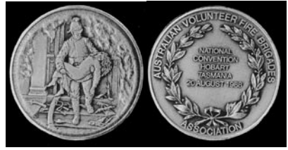
Plate 21. Obv. and Rev.

Metal: Sterling silver (14), bronze (300). Size: 51 mm \Phi . Maker: Stokes & Son, Melbourne. Note: The silver medals were presented to members of the centenary committee.