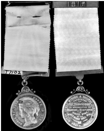
Plate 16. Obv. and Rev.

Mount Lyell Mining Disaster, Bravery Medal.