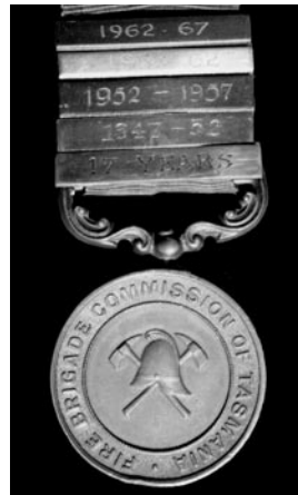
Plate 11. Obv.