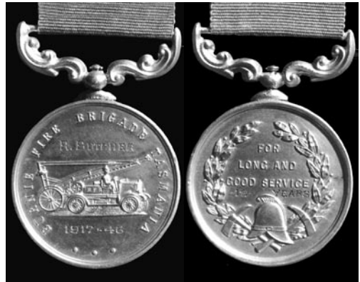
Plate 5. Obv. and Rev.