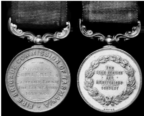
Plate 13. Obv. and Rev.

Fire Brigades Commission of Tasmania Special Medal.