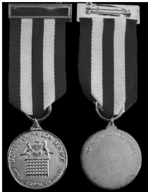
Plate 28. Obv. and Rev.

Tasmanian Prison Service 10 Years Long Service Medal.