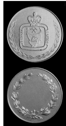
Plate 18. Obv. and Rev.

Tasmania Fire Service - Rural Brigades Competition Medal.