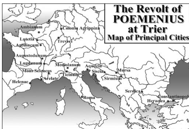
Fig 1. Map of Principal cities.

The empire was redivided, with Constans and Constantius now ruling west and east respectively. In spite of a few successful campaigns against the Sarmatians and Franks in 341–2 and an expedition