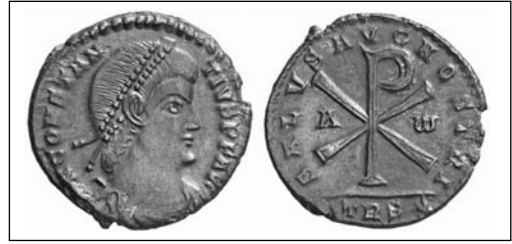
Fig 6. Constantius II, centenionalis, RIC Trier 332. Numismatik Lanz Auktion 125, lot # 1110.

introduced under Diocletian's monetary reforms may be compared to assaria of the second century AD, similar comparisons may be made between this new coinage and that of the tetrarchic period.