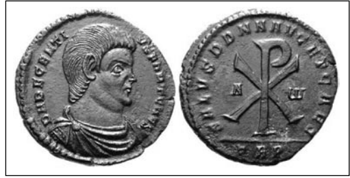
Fig 4. Decentius, centenionalis, RIC Trier 322. Tkalec Auktion 2003, lot #