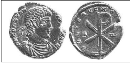
Fig 5. Constantius II, centenionalis, RIC Trier 335. Author's collection.