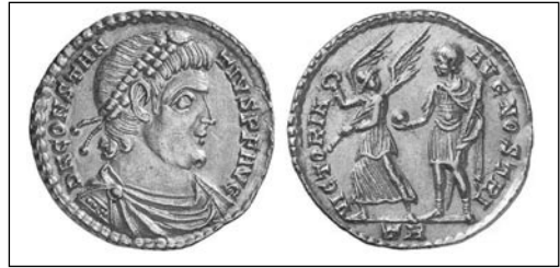
Fig 2. Constantius Gold Solidus, RIC Trier 329. Numismatica Ars Classica , Auction 25, lot # 602.

JPC Kent, in the 1959 Numismatic Chronicle , demonstrated that two issues of coinage struck at the Trier mint, one in gold and one in bronze, related to this chaotic time. iv Both bore the name of Constantius II, and were remarkably similar to certain coins of Magnentius. Perhaps more importantly, they had very little in common with any of the other coin types struck at any of the mints which were certainly under the control of Constantius