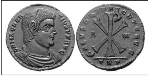
Fig 3. Magnentius, centenionalis, RIC Trier 320. CNG E-Auction 53, lot #